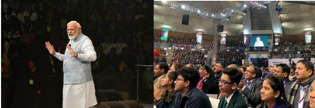
Pariksha Par Charcha 2020

The unique Town Hall format of the event in which the Hon'ble Prime Minister directly interacted with school students at the Talkatora Stadium, New Delhi was held on 20th January, 2020 . The event broadened its scope with an online competition for students that received 2.63 lakh entries . Students from all over India and also Indian students residing abroad from 25 countries participated. The event highlighted the need to embrace challenges as stepping stones for success.