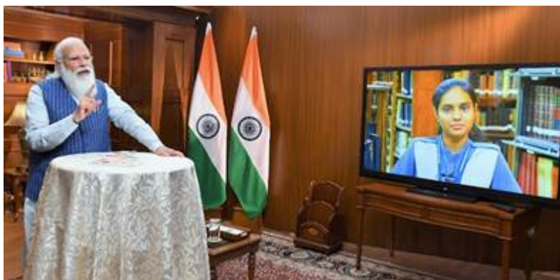
Pariksha Par Charcha 2021

In response to the COVID-19 pandemic, the fourth edition of PPC was held online on 7 April 2021 . Despite the challenges posed by the pandemic, the interaction continued to inspire students and their families. The focus shifted to resilience and adaptability, teaching life skills to help students navigate uncertain times.