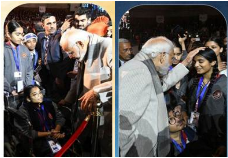
Pariksha Par Charcha 2023