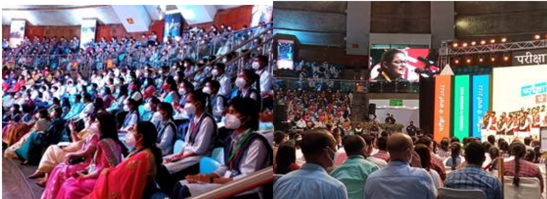
Pariksha Par Charcha 2022

5th Edition of PPC was conducted on 1st April 2022 at Talkatora Stadium, New Delhi. Hon'ble Prime Minister of India has interacted with students, teachers and parents in this programme and has given them his valuable suggestions/ inputs. 9,69,836 students, 47,200 employee and 1,86,517 parents viewed the live programme of Pariksha Pe Charcha-2022. The programme was telecast live by the many TV Channels and YouTube channel etc