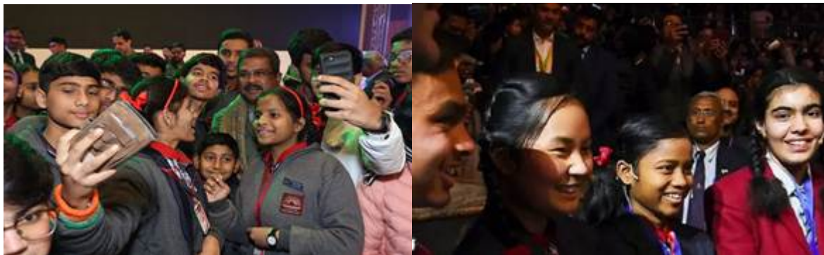
Pariksha Par Charcha 2024

The seventh edition of PPC, held on January 29, 2024 , was expansive with 2.26 crore registrations on the MyGov portal, it reflects the program's immense popularity and relevance. For the first time, 100 students from Eklavya Model Residential Schools (EMRS) participated, symbolizing the inclusivity of the initiative. The event was held in a town-hall format at Bharat Mandapam, ITPO, Pragati Maidan, New Delhi, with approximately 3,000 participants , including students, teachers, parents, and winners of the Kala Utsav.