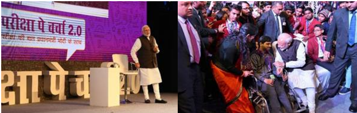
Pariksha Par Charcha 2019

On January 29, 2019 , the second edition of PPC took place at the same venue, witnessing an even greater level of participation. The interaction, which lasted for over ninety minutes, saw students, teachers and parents relax, laugh, and repeatedly applaud the Prime Minister's observations, which included a touch of humour and wit.