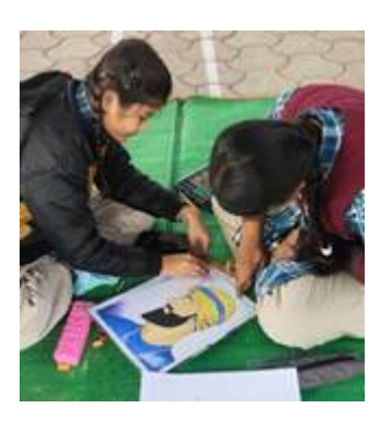
Children in National Bal Bhavan listening to the stories on valour and sacrifice of Sahibzades. Students participating in drawing competitions held in schools across the nation on Veer Baal Diwas.