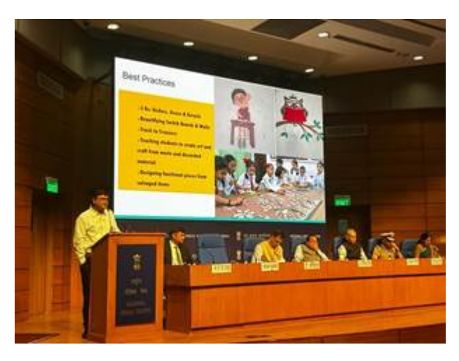
Secretary (DoSE&L) presenting at a press conference hosted by the DARPG at the National Media Centre in New Delhi