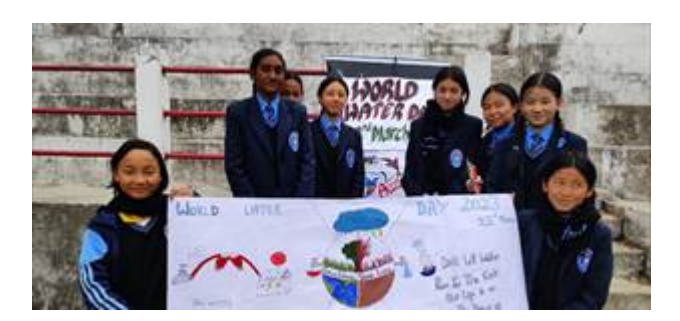
ECO Clubs at schools teaching their peers, school staff, parents & the community about environmental issues through club activities