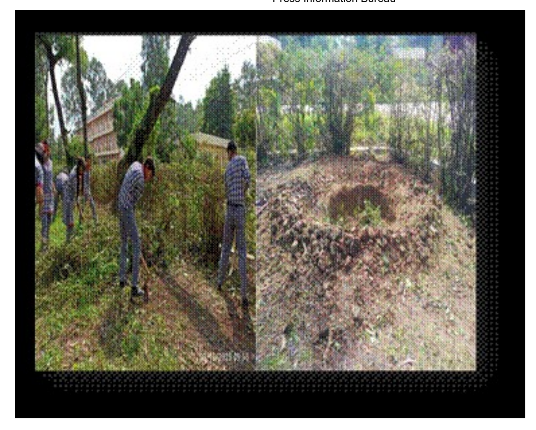
Students engaged in making compost pits at schools