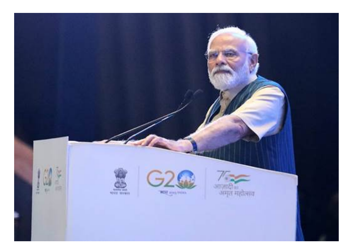
The Prime Minister also took a walkthrough of the exhibition showcased on the occasion.