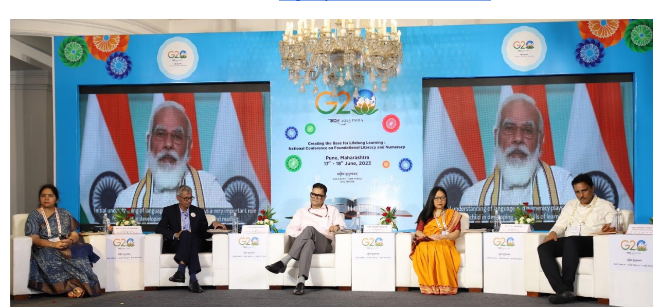
Short film link: <a href="https://youtu.be/kAcBtY7s2NM">https://youtu.be/kAcBtY7s2NM</a>

After the welcome address of Smt. Changsan, a short film on FLN was shown highlighting the importance of FLN along with the message of Hon'ble Prime Minister.