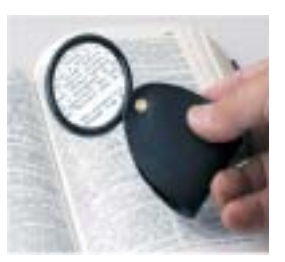
Fresnel sheet magnifier