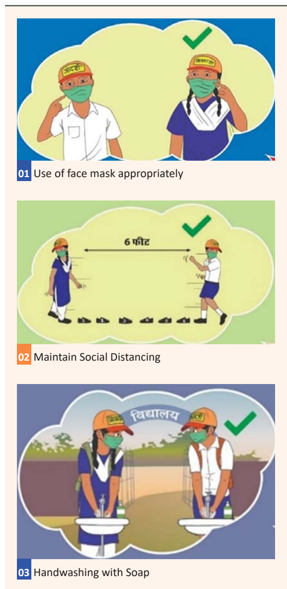
Figure 2: Key Preventive measures against “COVID-19”

Following are the three key measures critical for health and safety of children in schools and limiting the risk of COVID 19: