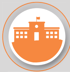
Government Aided schools