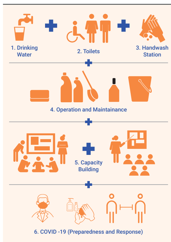
Figure 1: Swachh Vidyalaya Package

In 2014, The Ministry of Human Resource Development (now Ministry of Education), Government of India launched 'Swachh Bharat Swachh Vidyalaya' (SBSV) initiative to ensure that all schools in India have access to separate functional toilets for boys and girls. The initiative lays emphasis on promoting safe and appropriate hygiene practices in schools and behaviour among children.